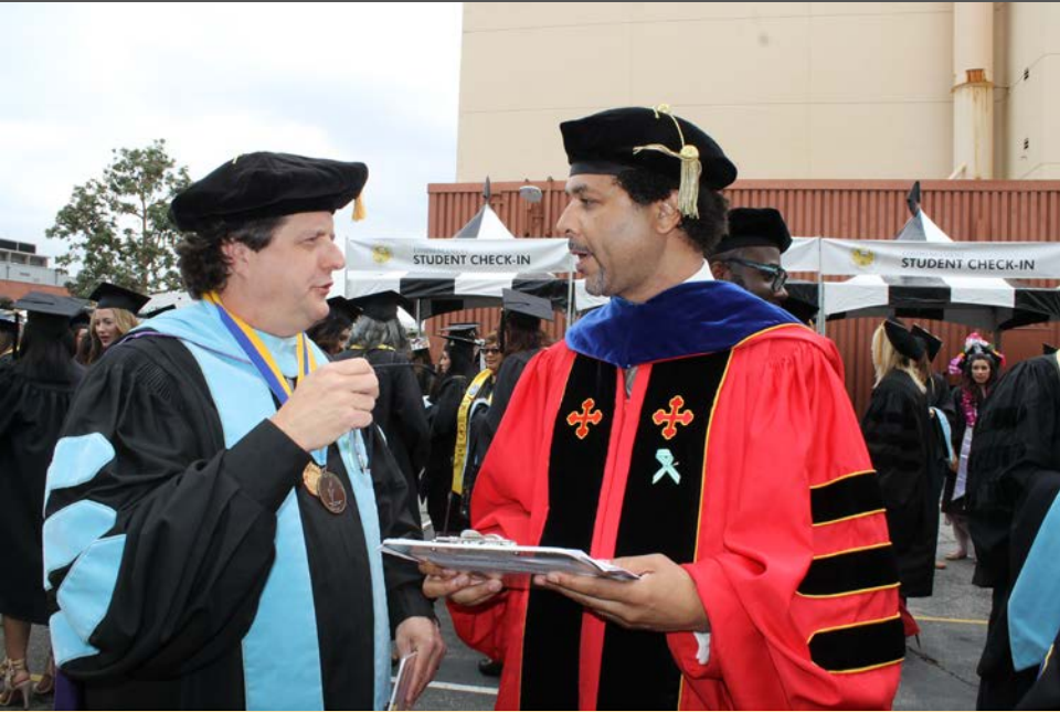
Faculty leaders for the 2018 CCOE Commencement